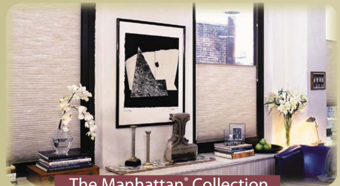
The Manhattan® Collection

Ever since its introduction in 1991, the exquisite Silhouette® product line has been constantly expanding to respond to the ever-growing needs and preferences of fashion-conscious consumers. Today, there's at least one Silhouette fabric color that's the perfect choice for any room or decor. There are seven fabrics, ranging from neutrals and pastels to intense hues, with distinct textures and varying degrees of light control.