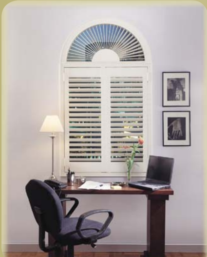
Plantation Custom Shutters

Plantation shutters are a beautiful combination of style, versatility and durability that add a warm, rich dimension to any setting. They are available in many different configurations: Bi-Fold track system, Bi-Pass track system, Double-hung windows, Café windows, Bay and bow windows, French and patio doors. They are rich with color finish choices and available with matching arches.