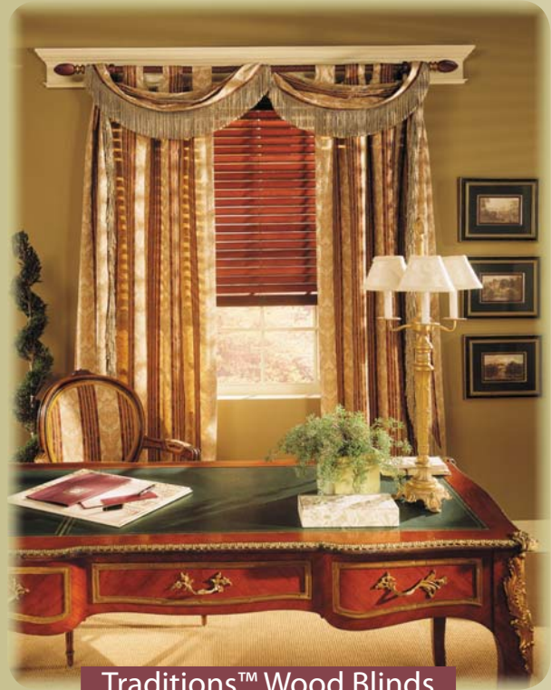
Traditions™ Wood Blinds

Plantation shutters are a beautiful combination of style, versatility and durability that add a warm, rich dimension to any setting. They are available in many different configurations: Bi-Fold track system, Bi-Pass track system, Double-hung windows, Café windows, Bay and bow windows, French and patio doors. They are rich with color finish choices and available with matching arches.